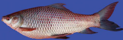
Rohu ( Labeo rohita )