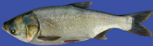
Silver carp ( Hypophthalmichthys molitrix )