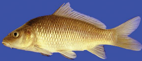
Common Carp ( Cyprinus carpio )