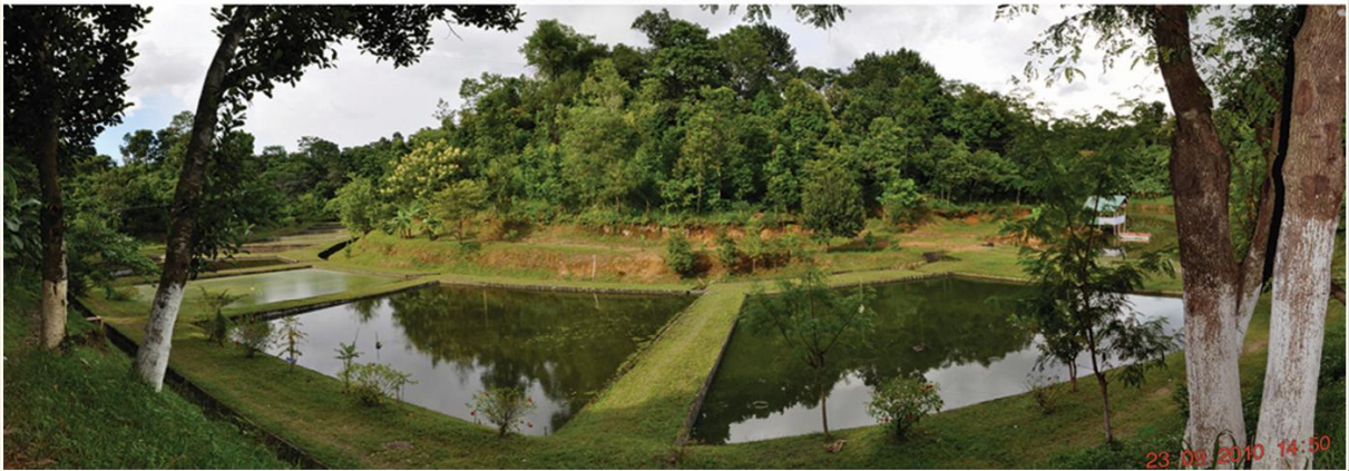
LENGPUI FISH SEED FARM