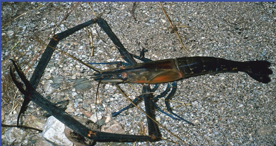
Giant Freshwater Prawn ( Macrobrachium rosenbergii )