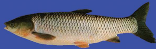
Grass carp ( Ctenopharyngodon idella )