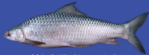
Mrigal ( Cirrhinus mrigala )