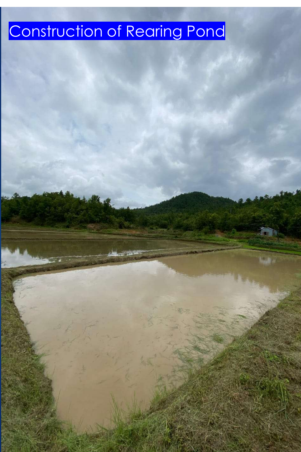
Construction of Rearing Pond