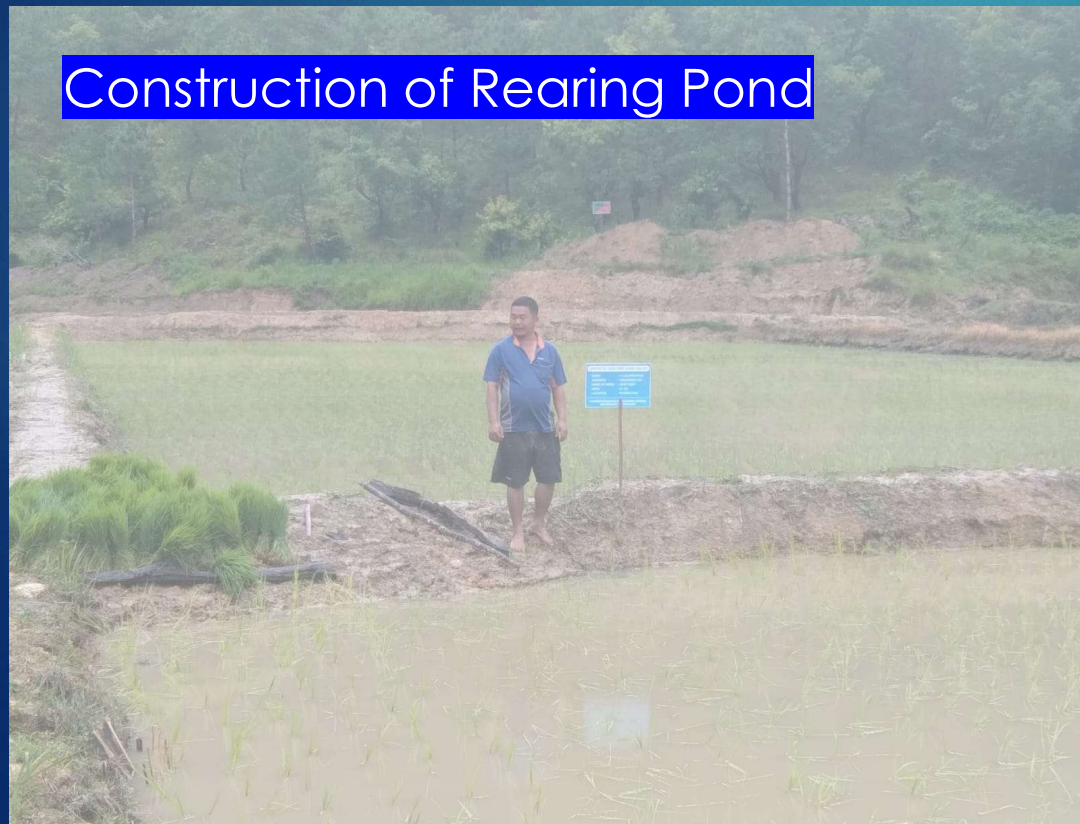
Construction of Rearing Pond