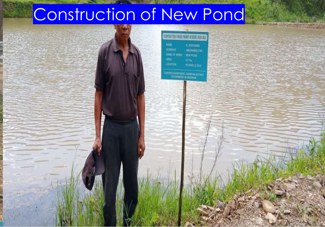
Construction of New Pond