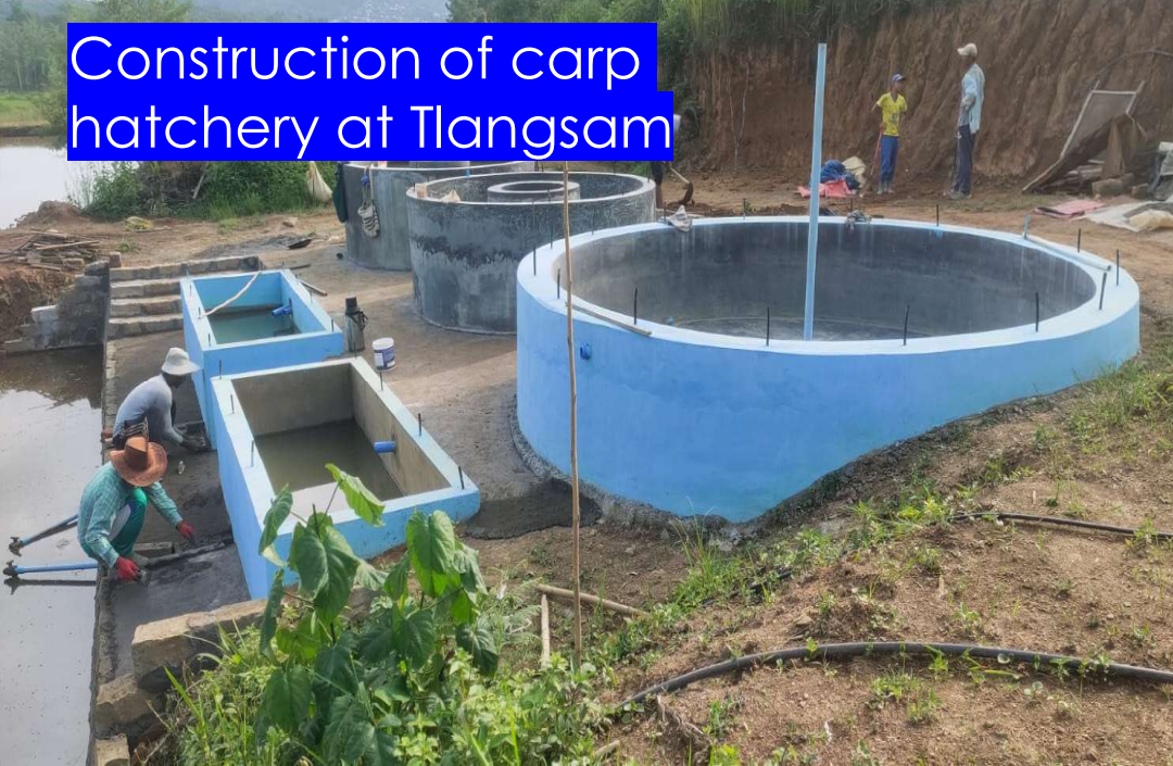
Construction of carp hatchery at Tlangsam